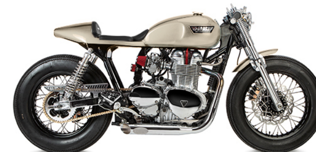
Colors available for both Gullwing versions.