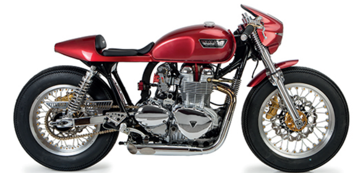
Gullwing X €39.900